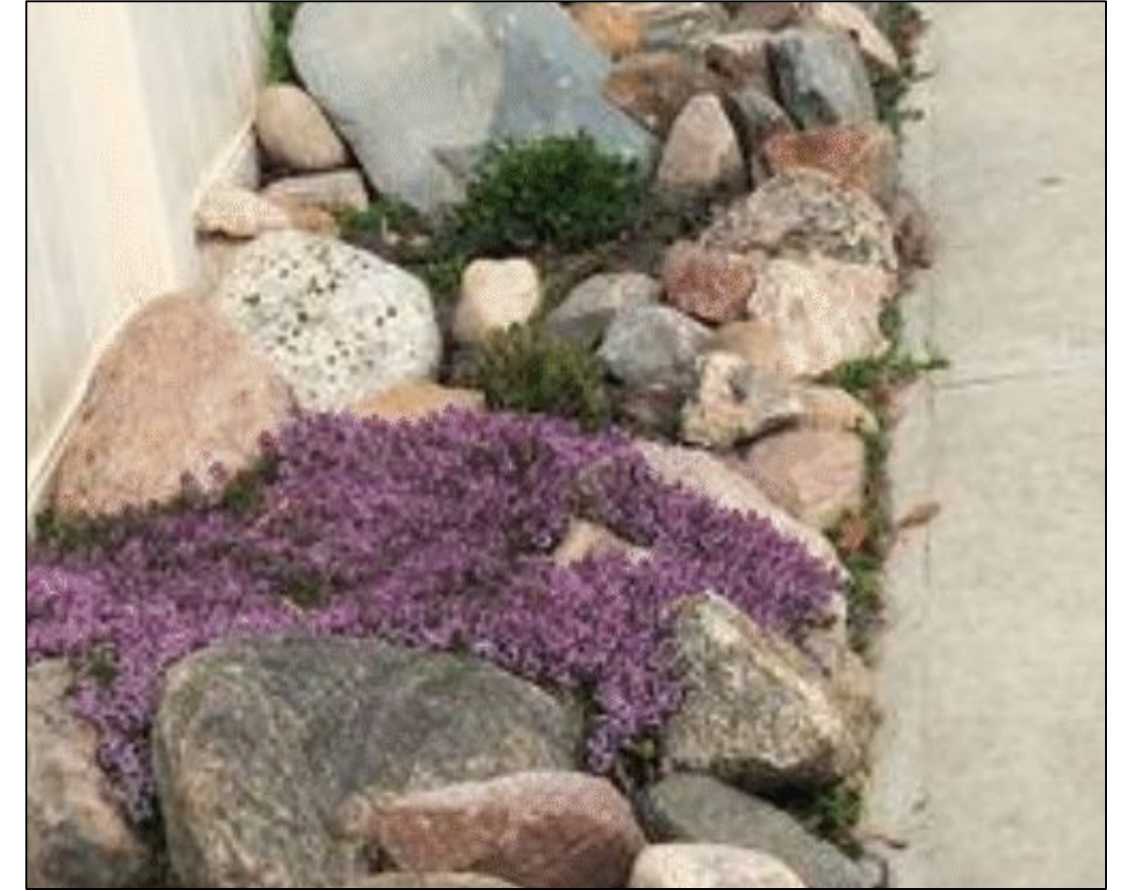
Sedum Rock Garden Continue to Rosa Rd